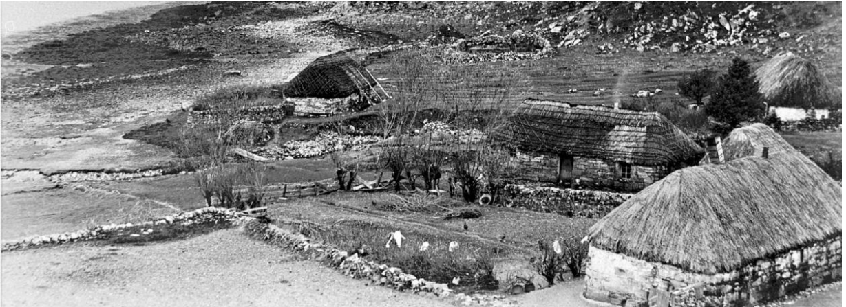
Lower Polish circa 1900