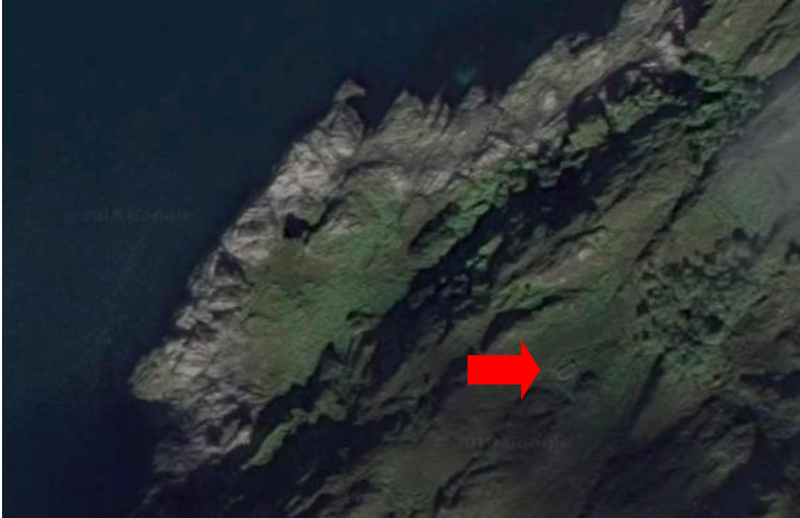
Example of an isolated shieling near the coast between Slochd and Mullochbuie