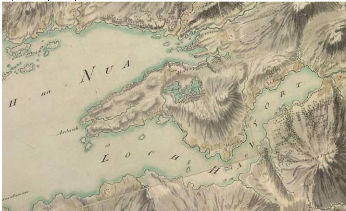
Roy's Military Survey of Scotland 1747-55

Compared with similar maps both before and after 1755, the detail and accuracy far surpasses all the others, and many of the latter maps, in terms of detail. The townships are clearly marked, and it also details an additional two townships, East of Laggan, with the name of Theodlin, although this may be some other reference. There is certainly evidence of several houses in this area still visible, and a large area enclosed by stone walls.