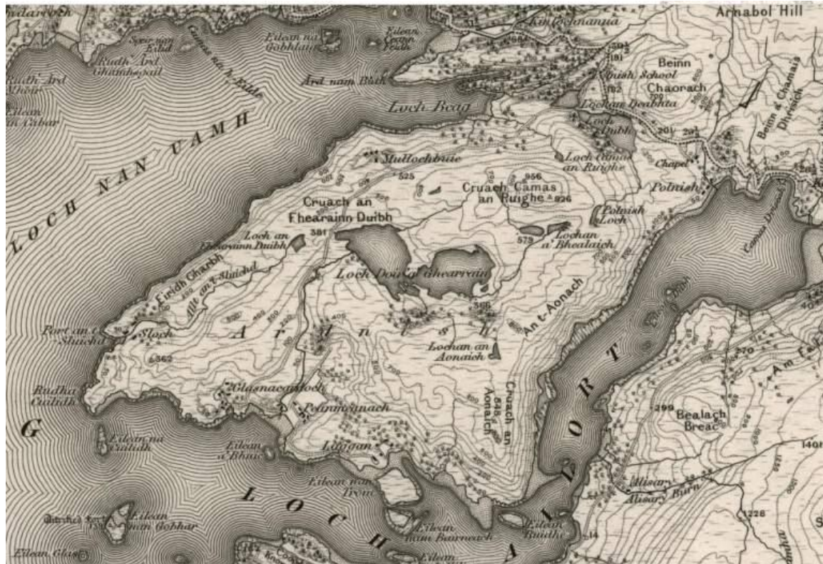
Ordnance Survey Map of Scotland – Sheet 61 – Arisaig Publication Date 1855