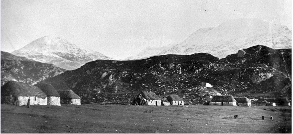
Peanmeanach circa 1900 (The bothy was built in the gap a few years later)